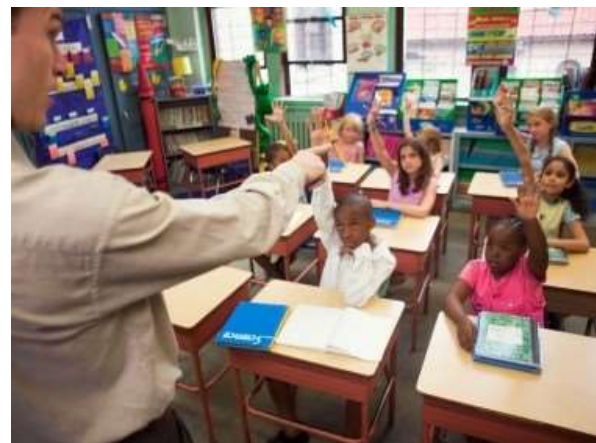
What Student Achievement Tests Tell Us About Teacher Effectiveness